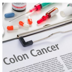
Ultra-Processed Food Consumption Associated with Risk of Colorectal Cancer in Men