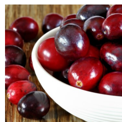
Whole Cranberry Powder Improves Endothelial Function in Healthy Male Participants